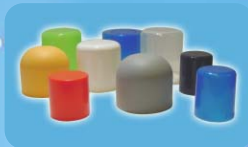
Caps: Forms and Colours