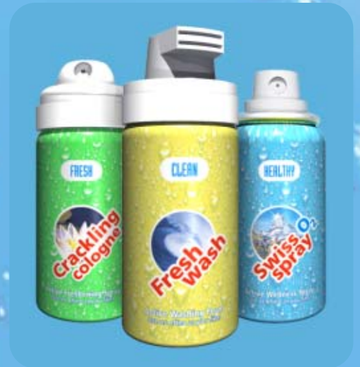
Clean, Fresh & Healthy